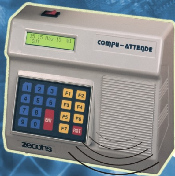
Proximity/Smart Card Reader