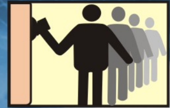
Time & Attendance